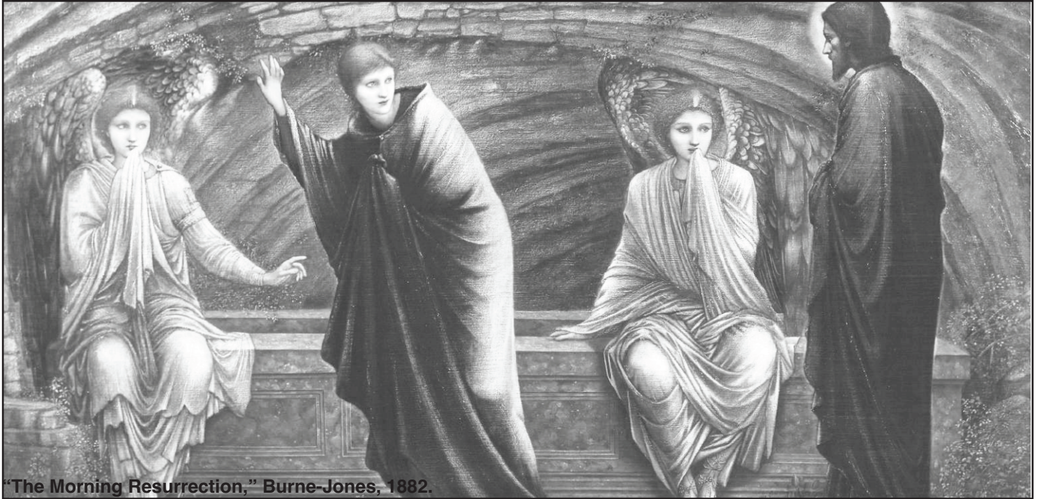
"The Morning Resurrection," Burne-Jones, 1882.

St. Basil's Parish is home to people of all ages and needs. For those who need hearing assistance, devices are available at the front desk. Simply leave a photo ID to borrow one during your visit.